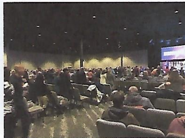
Crossroads Christian-Joliet IL