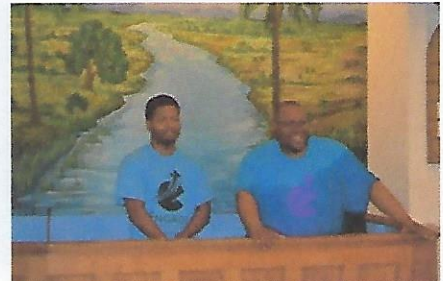
Engage Christian-Forest Park IL