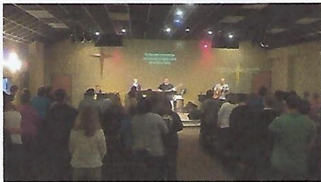
Adventure Christian-Bourbonnais IL